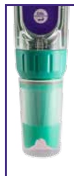
Protection cap used like calibration beaker