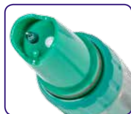
ORP 51 replacement electrode for ORP 5