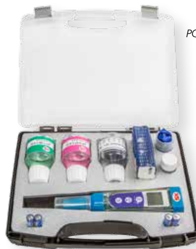
PC 5 kit