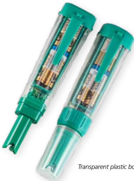
Transparent plastic body