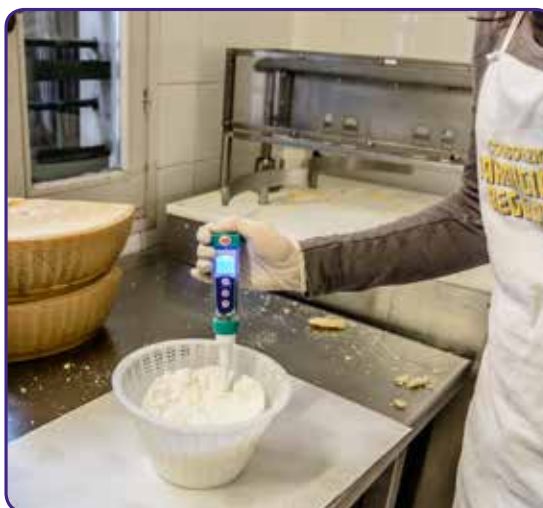
pH 5 FOOD