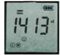
Display COND 1