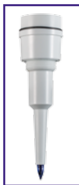
SPH51 Replaceable pH electrode for pH 5 Food