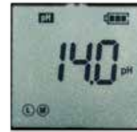
Display pH 1