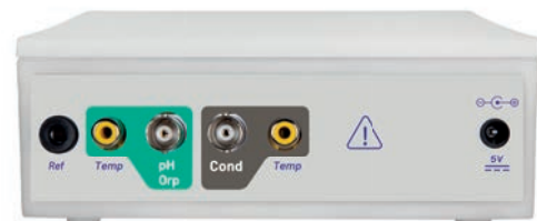
Connections PC 50 VioLab

The LED indicator allows you to keep always under control the state of the measurement