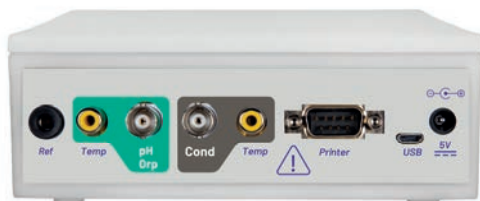
Connections PC 60 VioLab