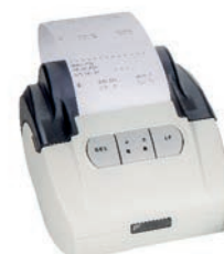
RS 232 printer