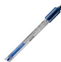
201 T DHS

Digital pH electrode with DHS technology. Temperature sensor integrated. Plastic body for general use. Maintenance free. pH: 0...14 - T: 0...60 °C cod: 32200103