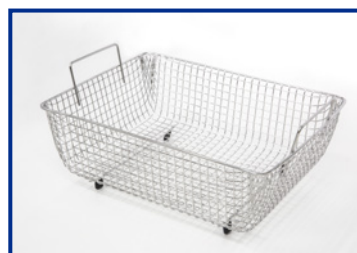
Mesh basket for all models