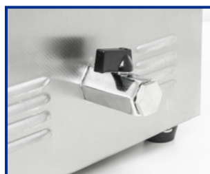
Emptying valve for DU-100 and AU-450