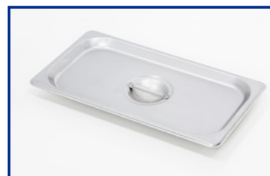
Stainless steel lid for all models