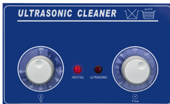
Front panel of AU series