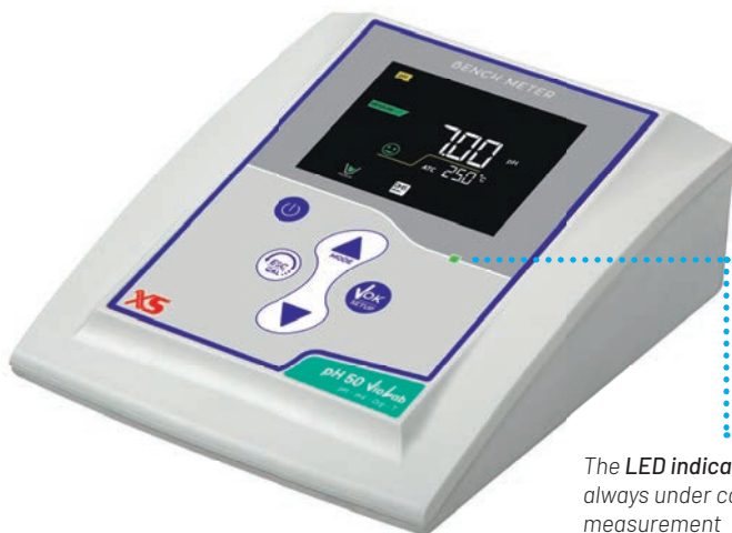
The LED indicator allows you to keep always under control the state of the measurement

All operations are constantly monitored and shown to the operator by the colored LED above the display and self-diagnosis messages .