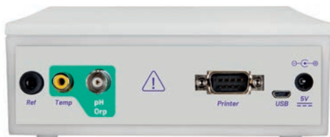
Connections pH 60 VioLab