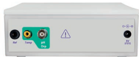
Connections pH 50 VioLab