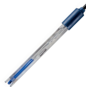
201 T DHS