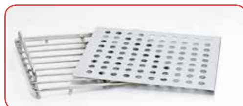
Holed platform applicable to wire shelves for TCN and TCF models