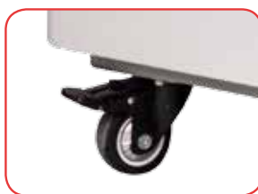
Wheels for ICN 200, TCN 200, TCF 200, TCF 400.