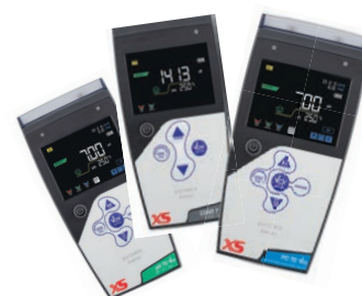
Conductivity meter and Multiparameter